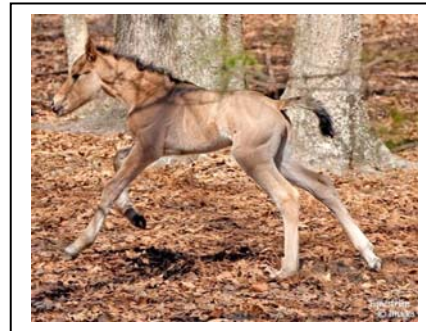
Lowcountry Geechee owned by Lee McKenzie