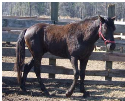
LL Smokey owned by DP Lowther